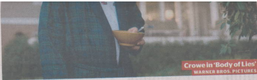
Crowe in 'Body of Lies'